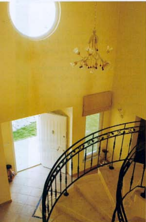
Above The wrought-iron spiral staircase adds an element of drama to the hall, which gets extra light from the round feature window