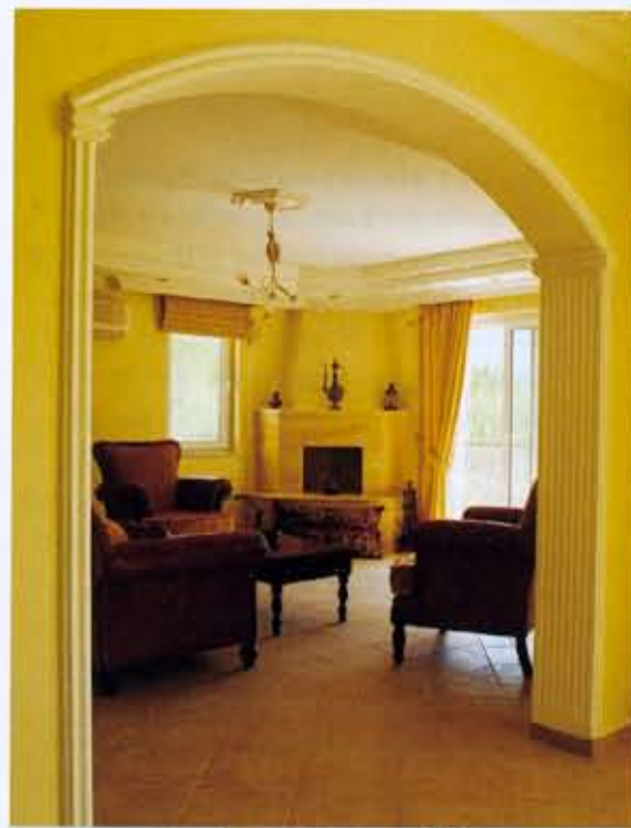
Above and right Details such as the fireplace and the mosaic tiles add to the appeal of the house